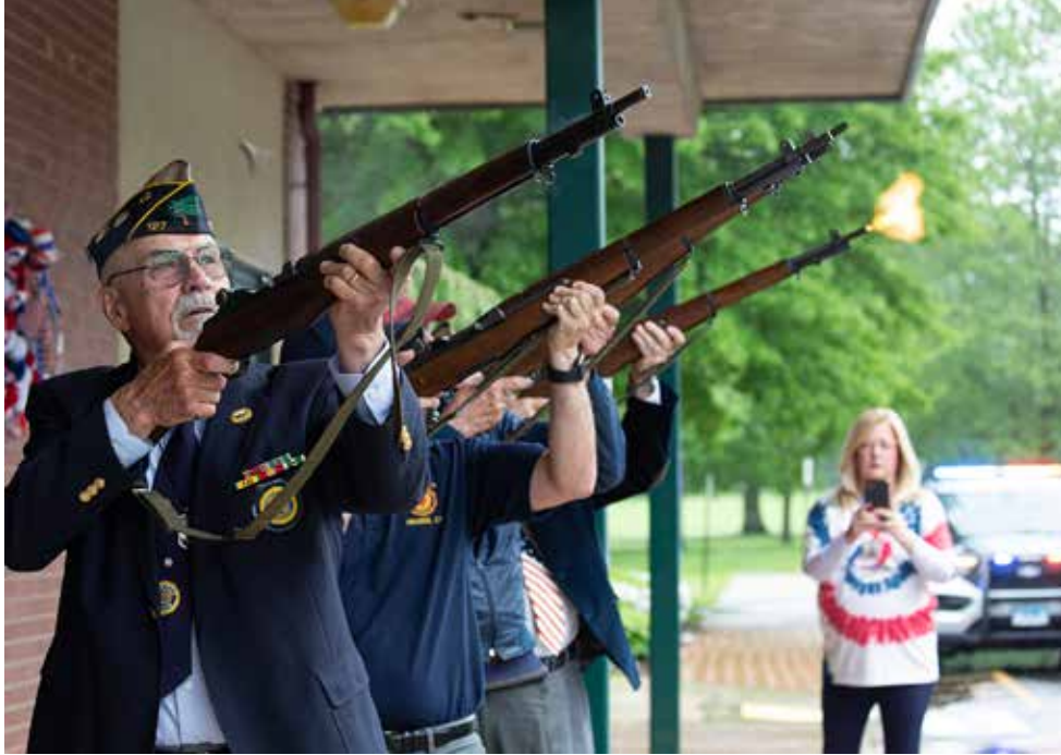
Rain dampened some of Orange's planned Memorial Day festivities on May 24, but speeches and ceremonies to honor the holiday continued indoors at High Plains Community Center, including with a visit from Gov. Ned Lamont.