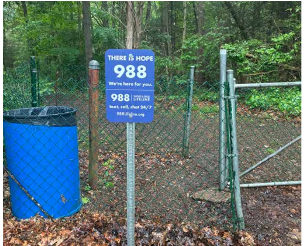
Orange Youth Services recently installed signs for the national Suicide and Crisis Lifeline in several locations around town.

Orange Youth Services and the Orange Prevention team recently installed three “988 There Is Hope” signs in town. Two are located at High Plains Community Center, and one is at the Wepawaug Conservation Area.