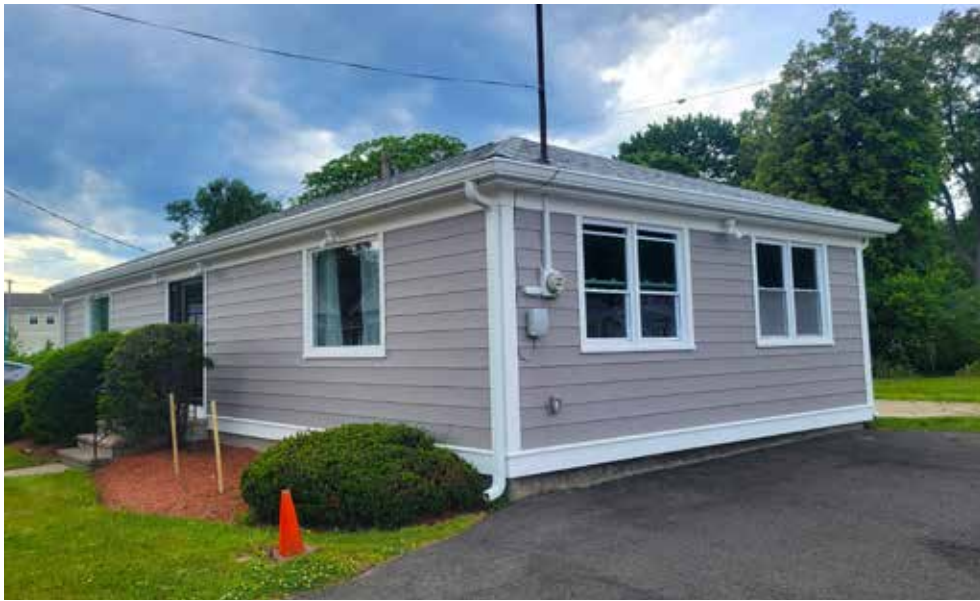
The Milford Regional Chamber of Commerce will move to a new location at 764 Boston Post Rd. in July.

"Congratulations to the Milford Regional Chamber of Commerce on their new location," US Sen. Richard Blumenthal said of the move. "The chamber has been a beacon for businesses in the region, providing support and resources, and connecting visitors and residents with all that Milford has to offer. This new location reflects their steadfast commitment to the community, and I look forward to visiting soon."