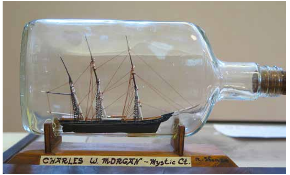
The Milford Marine Institute and the Milford Preservation Trust hosted a marine biology, whaling and marine shipping exhibit at the Taylor Memorial Library in Milford from May 22-24.