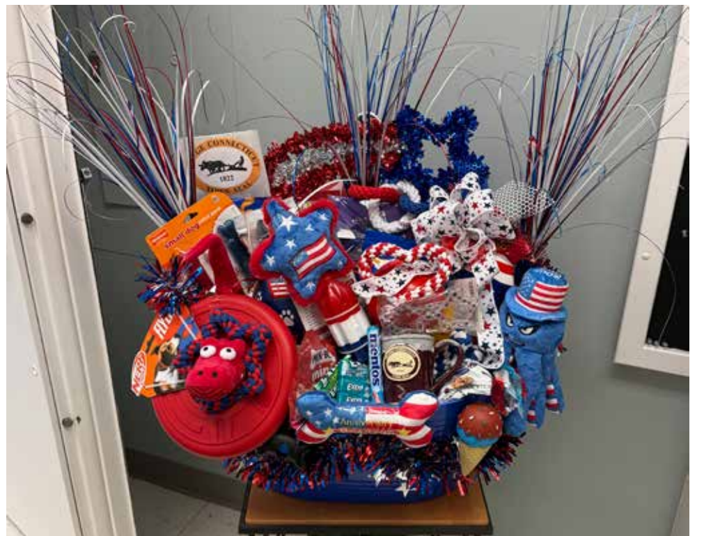
Orange will raffle off a basket of treats and toys to one of the dog owners who obtain licenses in town this June.

June is the renewal month for dog licenses for all dogs six months and older in Orange, and the town is automatically entering all those who obtain a dog license into a raffle to win a basket of dog treats and toys.