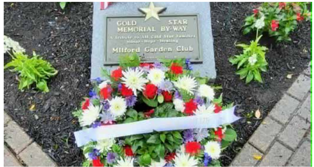
The Milford Garden Club recently laid a wreath at the Gold Star Memorial on the Milford Green in honor of Memorial Day. The marker is dedicated to Gold Star mothers and families whose loved ones died in active-duty military service while defending America. When the club installed the memorial in 2022, it was the first of its kind in Connecticut. The wording on the marker is: “Gold Star Memorial By-Way; A tribute to all Gold Star Families; Honor – Hope – Healing; Milford Garden Club, National Garden Clubs, Inc.”