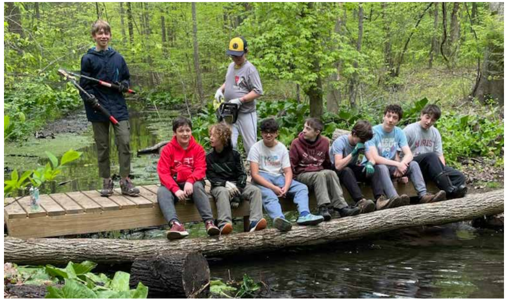
Scout Troop 41 was instrumental in clearing fallen trees and debris from the trails of the Whitney Tract along Mapledale Road in Orange on May 9.